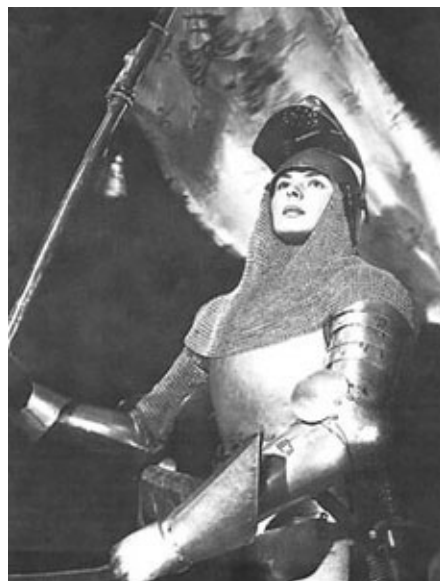
"Aide toy, Dieu te aidera" ("God helps those who help themselves"). Jeanne d'Arc

Second: There's the embarrassing problem that there hasn't been a French military victory since the 15th century, in a campaign which was lead by a paranoid schizophrenic girl.