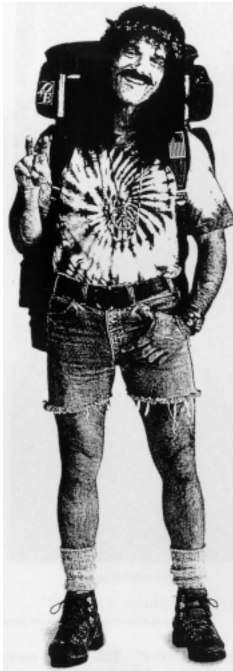
Backpacking like you remember it.

Where else can you find a location as dramatic as Thousand Island Lake? Or a more genial group of friends with whom to share it?